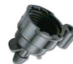
1014377 Mini Sprinkler Adaptor for direct on-tube application. Clips onto 5 mm round stake