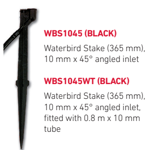
WBS1045 (BLACK) Waterbird Stake (365 mm), 10 mm x 45° angled inlet

Toro has a comprehensive range of Mini Sprinkler Stakes and accessories to suit a variety of applications.