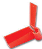
WBD180B(BLACK) WBD180R(RED) Deflector to suit all Waterbirds